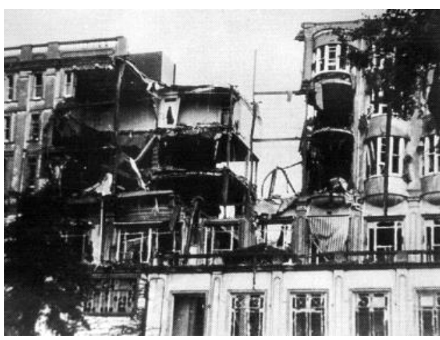
After the bombing